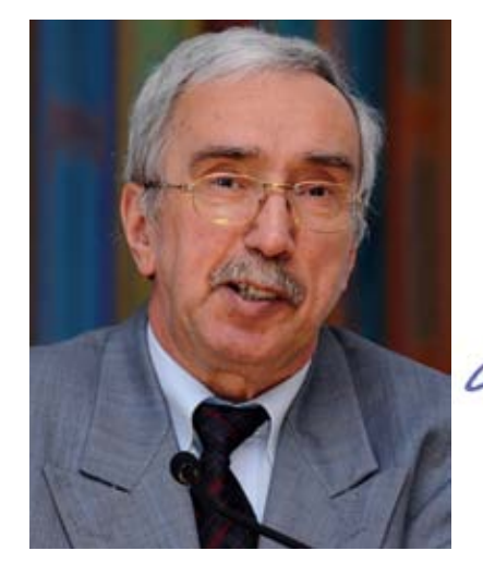
A warm welcome in Aachen on 18. September!

We have made an overall programme that combines management, technological and organizational themes enlightened with company visits and an attractive informal part, providing an ideal breeding ground for addressing current topics, discussing technological developments and exchanging day-to-day issues that play a role in our industry.